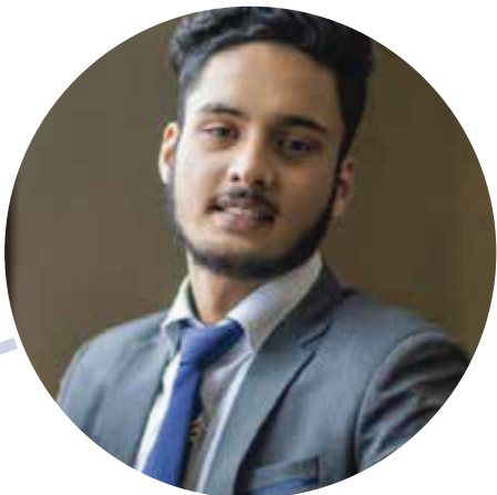
BBA ( Global Business)