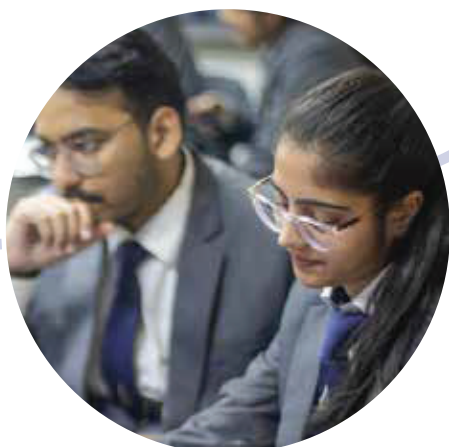
BBA (Accountancy, Taxation & Audit)