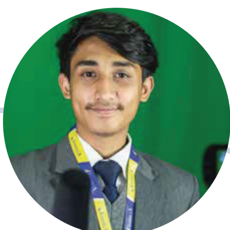
B.Sc B.Sc in Media Science