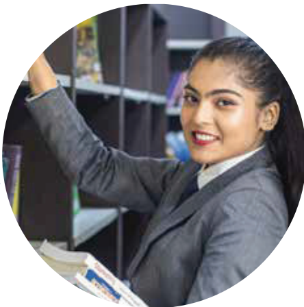
BBA ( General)

Inspiria Knowledge Campus offers 12 UNDERGRADUATE PROGRAMS.